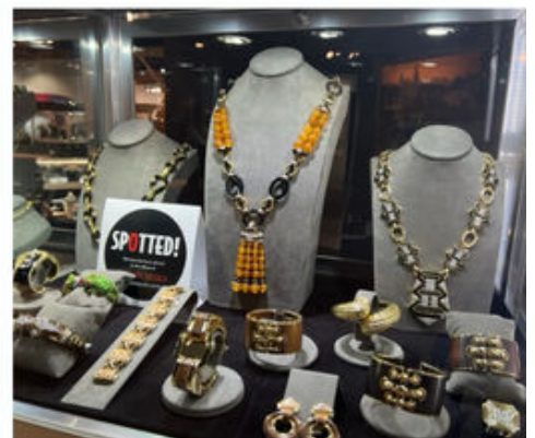
A small sampling of items chosen by Florida Design's Style Spotters.