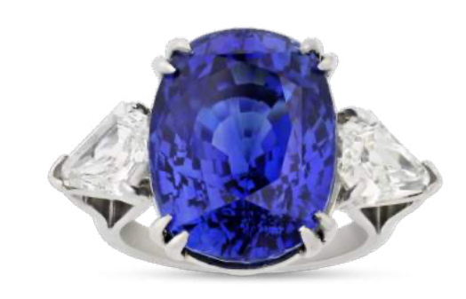
Ceylon Sapphire Ring, 19.71