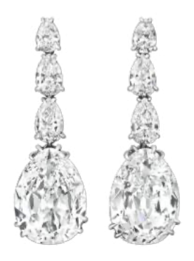
Carats Golconda Diamond Drop Earrings, 14.31 Carats