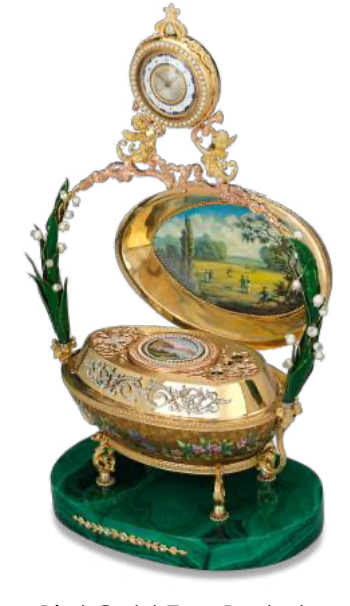
Singing Bird Gold Egg Basket