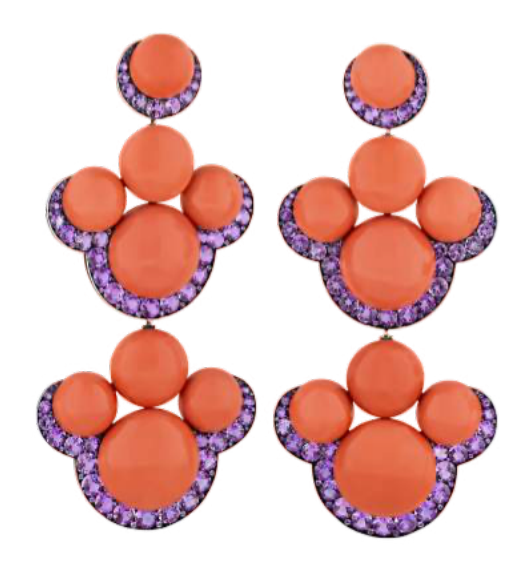
Coral and Amethyst Earrings by JAR