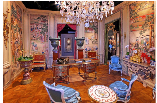
Steinitz Gallery at the 2016 Palm Beach Jewelry Art