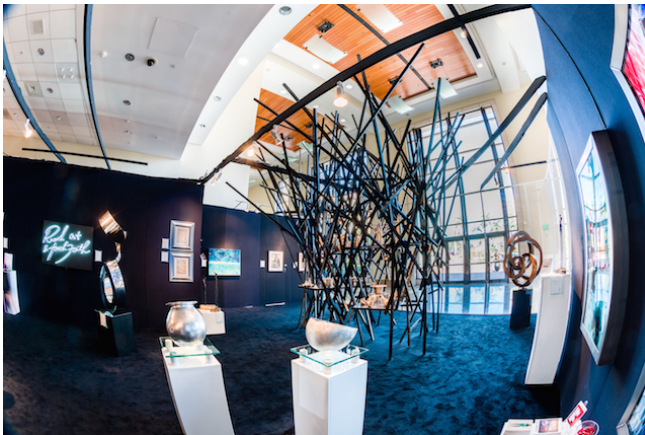
Long-Sharp Gallery at the 2016 Palm Beach Jewelry, Art & Antique Show

Prominent international galleries, and British Art Dealer Association (BADA) members, each leaders in their respective categories were represented at the show including; Apter-Fredericks, Berwald Oriental Art, Butchoff Antiques, Callaghan Fine Paintings, Cohen & Cohen, Daniel Crouch Rare Books, David Brooker Fine Art, Earle D. Vandekar of Knightsbridge, Gladwell & Patterson, Haynes Fine Art of Broadway, Imperial Fine Books, Jonathan Cooper, Park Walk Gallery, Lawrence Steigrad Fine Art, Mallett, Peter Finer, Priestley & Ferraro, Richard Green Galleries, Santos, Trinity House Paintings and Willow Gallery.