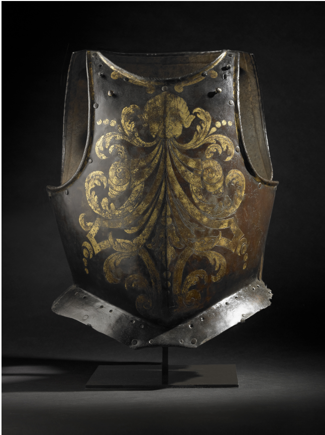
Peter Finer Booth # 4005

A Brescian engraved and gilt cuirass for use by the Papal Swiss Guard, circa 1623-44