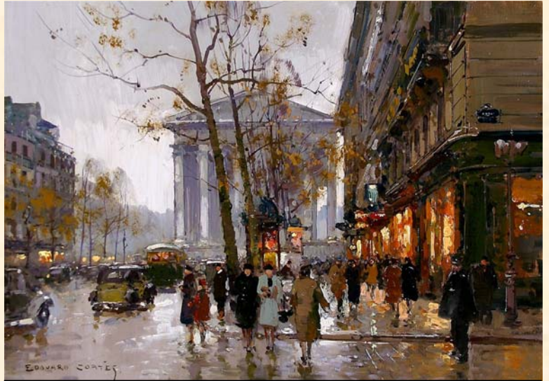
Edouard L. Cortes (1882 - 1969) "Madeleine and Rue Royale, Paris" Oil on canvas 13 x 18 inches