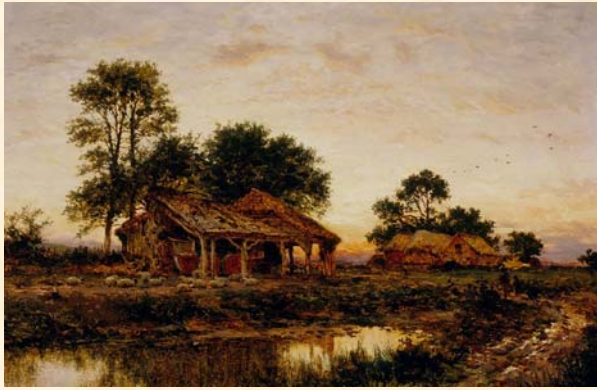
Benjamin Williams Leader, R.A. (1831-1923) "The Outskirts of a Farm, Evening" Oil on canvas English School, signed & dated 'B.W. Leader. 1889' 21 1/2 x 18 5/16 inches, canvas

Other beloved American artist who I have long admired and whose work will also be on display include Maxfield Parrish, John Singer Sargent, William Merritt Chase, William Mason Brown, Daniel Ridgway Knight and a host of others.