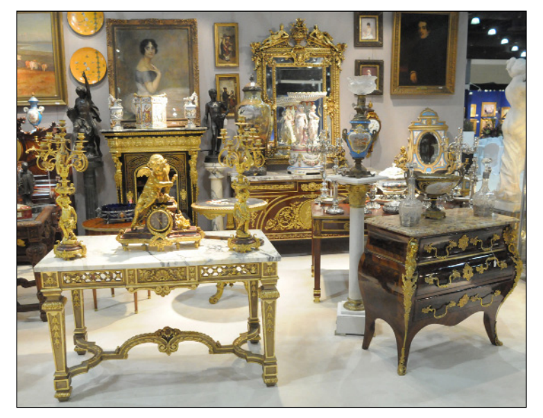
Kolendar Antiques, Hallandale, Fla