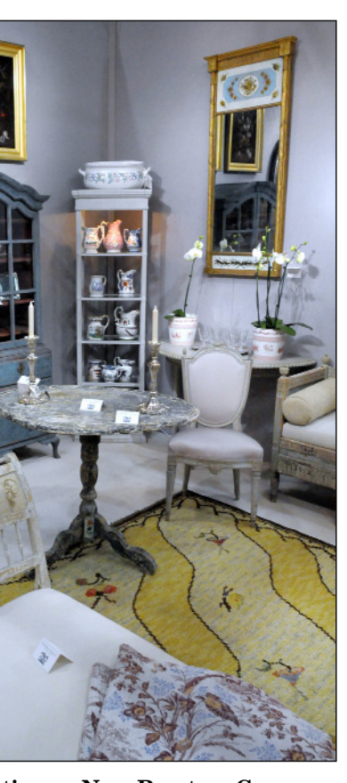
Dawn Hill Antiques, New Preston, Conn.