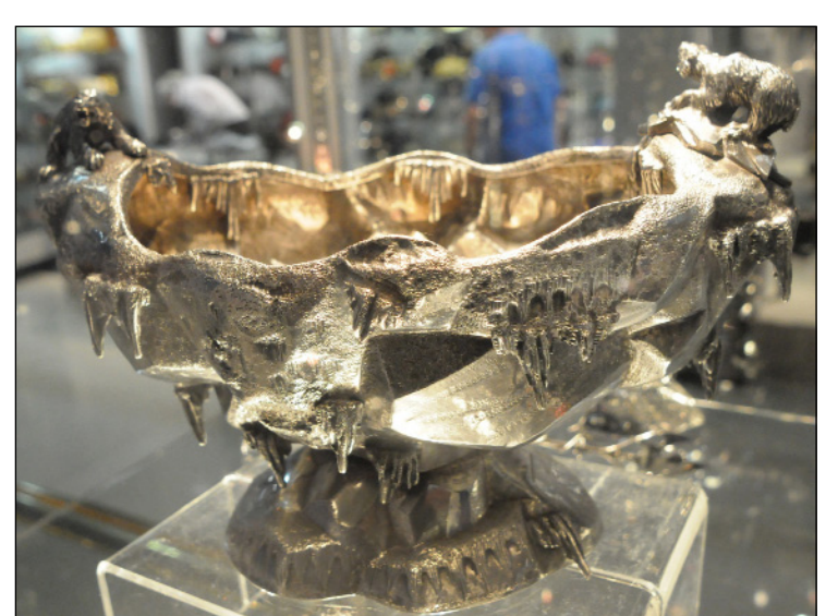
The iconic Gorham masterpiece, the "Iceberg" ice bowl and tongs that was made to celebrate the 1867 purchase of the Alaskan Territory from Russia at Spencer Marks, Southampton, Mass.