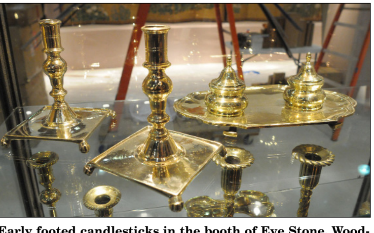
Early footed candlesticks in the booth of Eve Stone, Woodbridge, Conn.