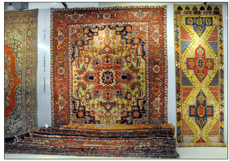
Gallery Afrodit, Ankara, Turkey