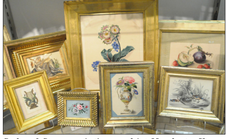
Carlson & Stevenson Antiques and Art, Manchester, Vt.