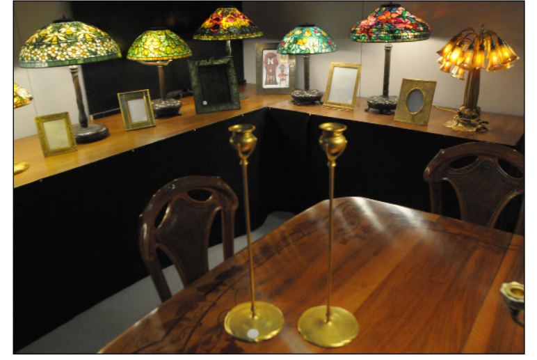
Tiffany lighting ranged from candlesticks to leaded glass lamps at Macklowe Gallery, New York City.