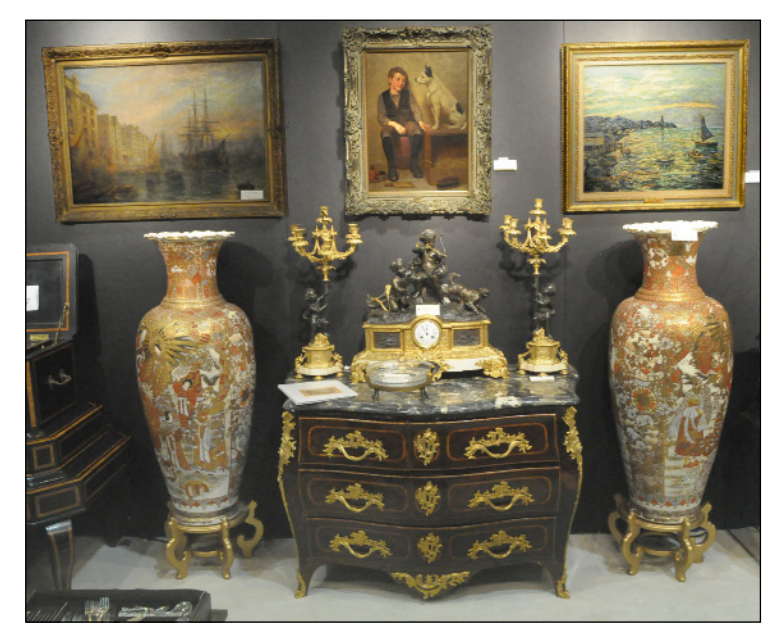
Bruce Kodner Galleries, Lake Worth, Fla.