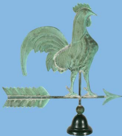
Rooster weathervane with excellent verdigris surface on a bell-shaped, windsor green, cast iron base.