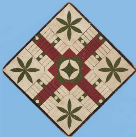
Red & green parcheesi board with great craquelured surface, on heavy artists' board, late 19th century.